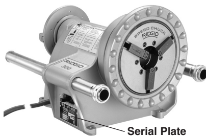
Figure 1 – Machine Serial Plate Location

SUBJECT: RIDGID® Universal Motors, sold as part of a 535, 300 Compact or 1233 Threading Machine, 300 Power Drive or a Hose Machine or sold separately as a replacement motor for these units, manufactured between April and November 2008. See separate list of affected products.