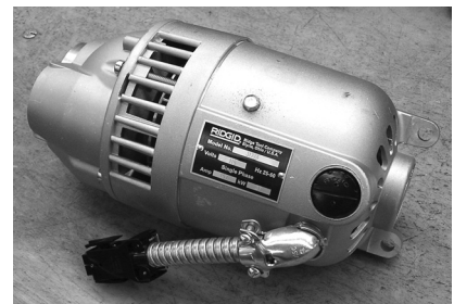
Figure 3 – RIDGID Universal Motor